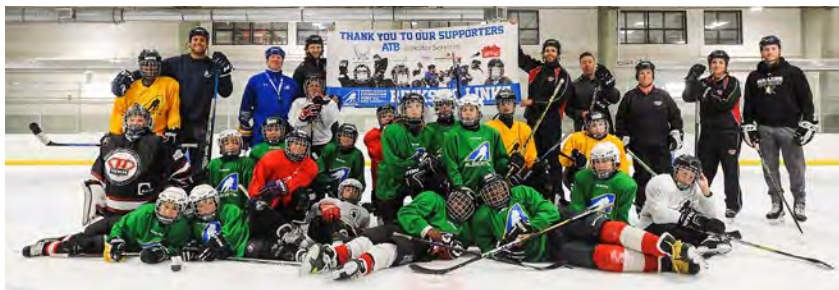
Rinks to Links – introducing kids to hockey.