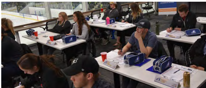
Future Leaders coaching development workshop in Red Deer.