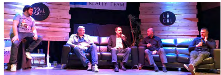
Mike Civik, Jamie Macoun, Colin Patterson and Brian McGrattan share stories at the Battle of Alberta in Red Deer.