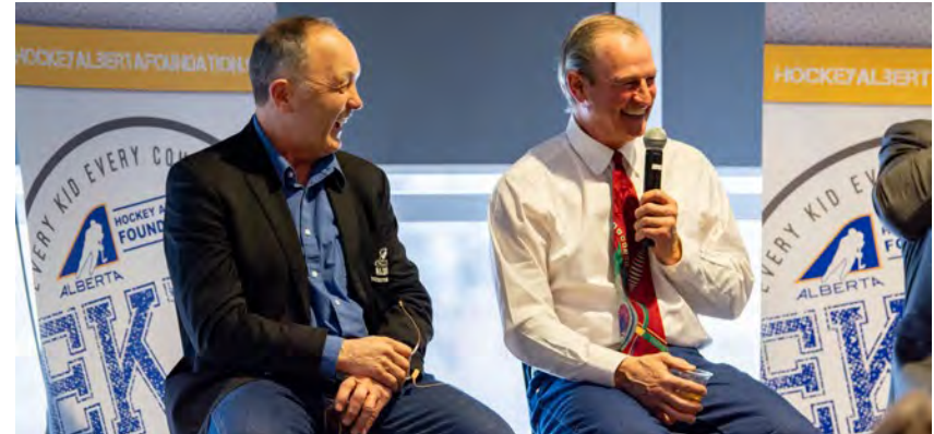
Brian Trottier and Brian Sutter reminisce in Lethbridge.

The event was held at Bo's Bar and Grill in Red Deer, and included a Hockey Hot Stove with NHL alumni Curtis Glencross, Jamie Macoun, Brian McGrattan and Colin Patterson, along with hourly draw prizes, grand prizes of tickets to see the Edmonton Oilers vs the Calgary Flames, and a Westjet raffle prize.