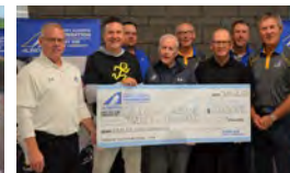
Cheques presented to Sport Central, Comrie's Sport Bank and KidSport Alberta.