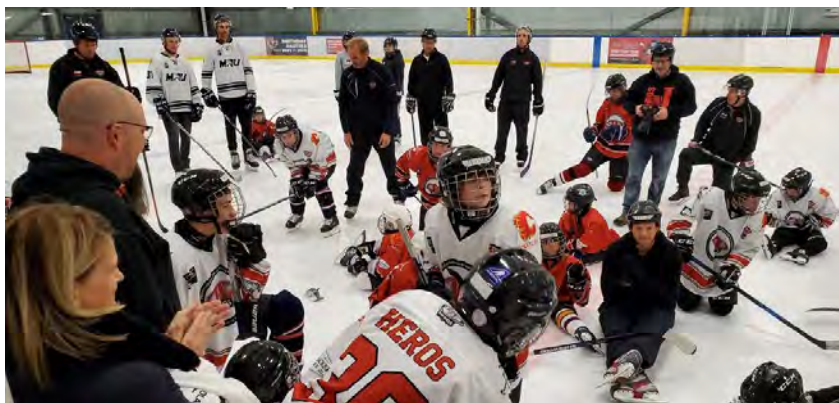
HEROS Hockey – hosting Super HEROS