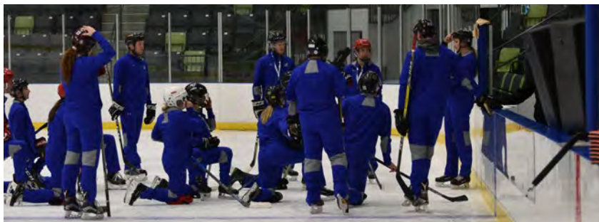
Future Leaders hosted in Red Deer.