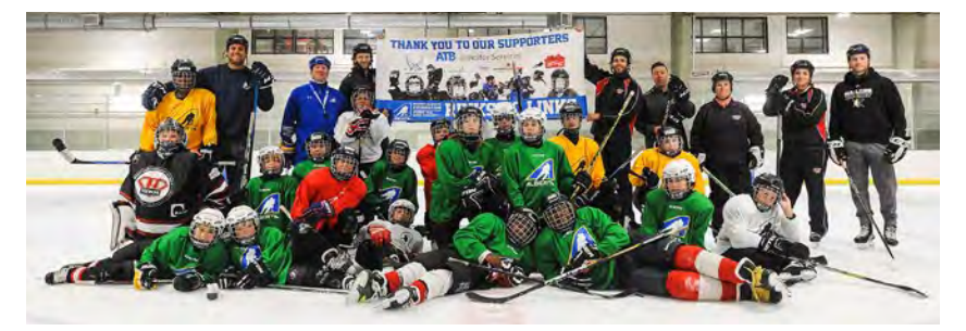
Rinks to Links – introducing kids to hockey.