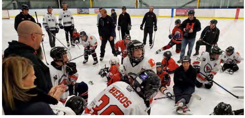
HEROS Hockey – hosting Super HEROS